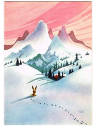
Psalm 121 A song of ascents.